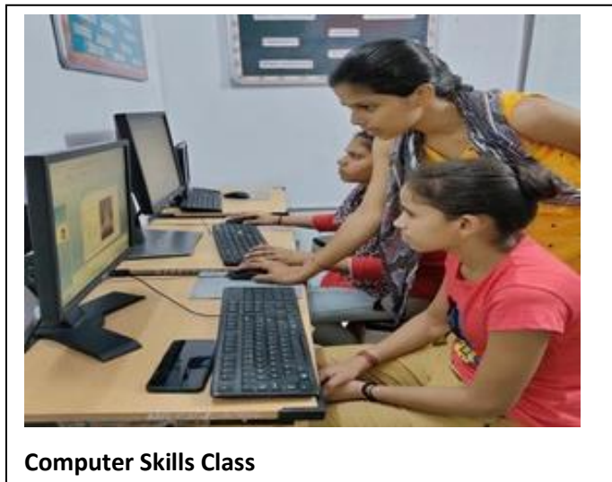
Computer Skills Class