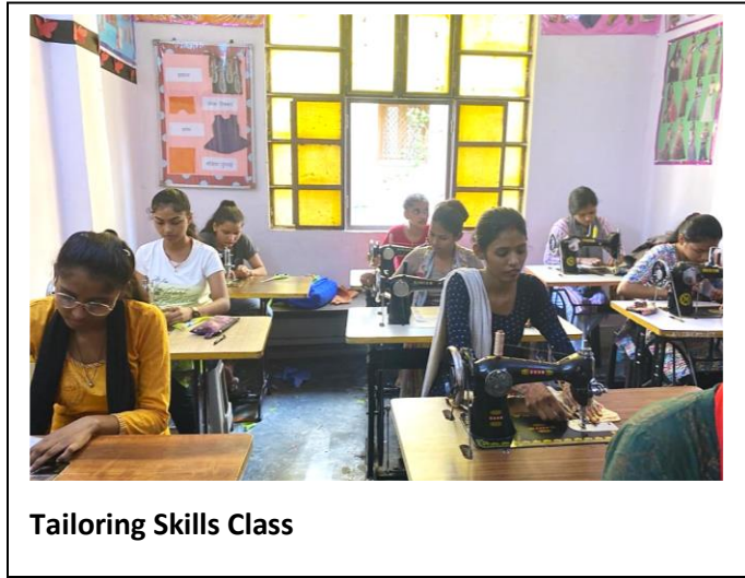
Tailoring Skills Class