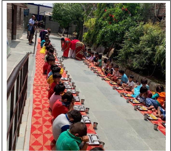
NIPUN children gathered for a meal after morning

Nutritional Program: Vision Builders has been sponsoring a nutrition program at NIPUN where supplementary nutrition (Mid-Day Meal) is provided regularly to about 350 underprivileged children of Kapashera (110 children) & Meera Bagh (240 children) areas. The program aims to improve nutrition, and also seeks to help at-risk children through the provisioning of need-based support and referral services.