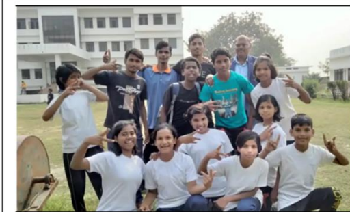
Competitive football (soccer) team

At Kutumb, children are engaged in supplemental education classes, workshops, music lessons, dance training (Kathak and Hip-Hop), meditation & yoga sessions, playing games or simply playing with each other. Kids participated in various music and dance shows, and in local sports.