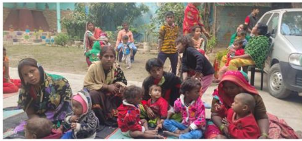
Maternal Health Patients gathered outside a Camp