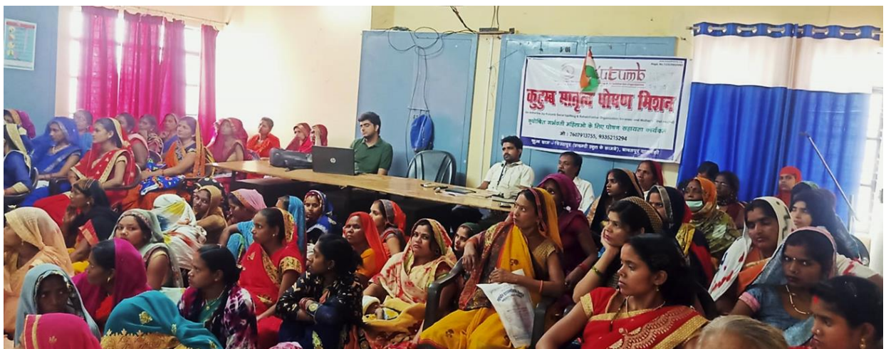
Instructional session in progress as part of the Kutumb effort to help would-be-mothers during

Kutumb Maternal Nutrition Program: Kutumb identifies malnourished pregnant women in the surrounding community and provides them nutritional, medical assistance, and psychological support during the entire pregnancy and beyond. The program has been a success in ensuring normal deliveries with healthy babies and mothers. In 2021 Kutumb helped approximately 200 expectant mothers. In 2022, the program has continued to be a success. There is an additional new capability with the addition of a mobile clinic to facilitate these health camps by bringing healthcare closer to pregnant women in remote villages.