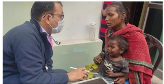
Consultation for a young mother at Maternity Camp

Kutumb Maternal Nutrition Program: Kutumb identifies malnourished pregnant women in the surrounding community and provides them nutritional, medical assistance, and psychological support during the entire pregnancy and beyond. The program has been a success in ensuring normal deliveries with healthy babies and mothers. In 2021 Kutumb helped approximately 200 expectant mothers. In 2022, the program has continued to be a success. There is an additional new capability with the addition of a mobile clinic to facilitate these health camps by bringing healthcare closer to pregnant women in remote villages.